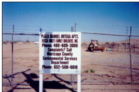
The NFWSC stakes out property in Arizona with a 9% tax credit for the Plaza Manuel Ortega Apartments.