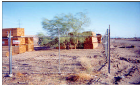
Construction of 80 units for Plaza Manuel Ortega is under way.