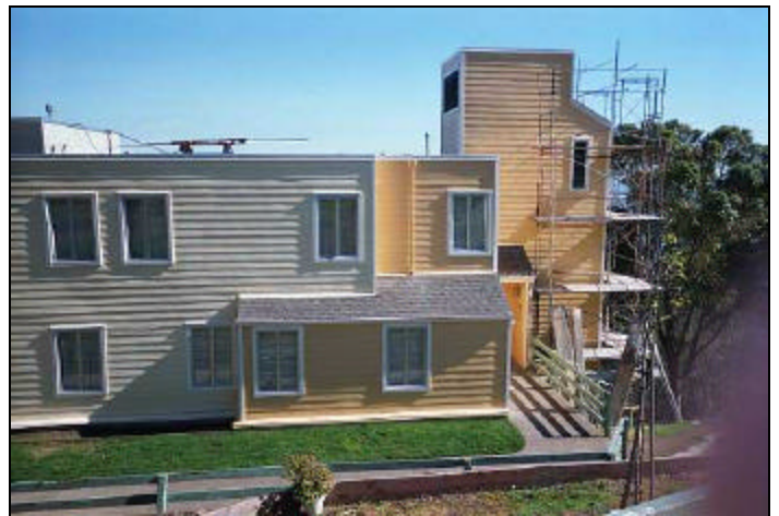
All building exteriors have been rehabilitated with the completion of Phase I.

Site work for Phase II will be completed in the following months. And in terms of financing, the NFWSC is working to close out loans from Citibank and to make CHFA the permanent lender for a 30-year mortgage. Phase III will involve the complete rehabilitation of the interiors of the buildings and will begin next year.