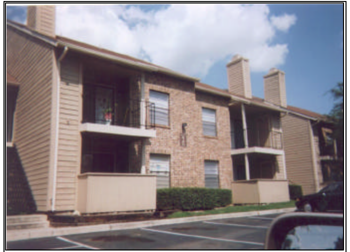
A majority of the rehabilitation involves painting and the exterior woodwork.

Subsequent to the acquisition, we have begun a rehabilitation of the property that will total $200,000. Construction is being completed by Concept Builders of San Antonio. Certain units have fireplaces, washer and dryer connections, vaulted ceilings, and ceiling fans. Amenities on the property include two swimming pools, three clothes care facilities, and a fitness center.