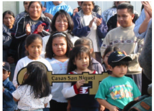
Some of the beautiful children finally holding the key to a healthy, safe home to grow in.

Phase III, or the community center of the Casas San Miguel project, is in the schematic phase. The architectural firm of Del Campo & Maru of San Francisco was selected to design the community center. Along with Del Campo & Maru, the NFWSC identified Explorer (Continued on page 2)