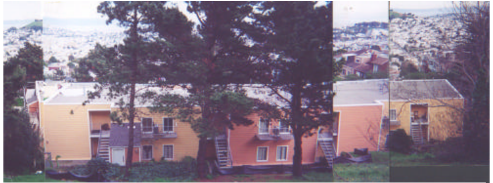
The exterior rehabilitation on Bldg. 3 is complete and it looks fabulous. The new yellow/red paint adds so much life to the surroundings and is a vast improvement on the past.

The rehabilitation is still marching onward. With building #3 complete and the Certificate of Substantial Completion signed on February 15, 2002, attention can be put on the larger buildings #1 and #2. The new roof on building #3 is doing its job well in the typically rainy Bay Area weather.