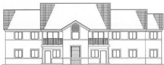
FRONT AND REAR ELEVATIONS 1/32"=1'-0"

El Mirage is a city in dire need of affordable housing for working people. As a poor community with a housing stock that simply cannot meet the needs its residents, the city would do well with having such a large infusion of affordable rental housing. However, the NFWS has met with some resistance from city bureaucrats. The Planning Commission, upon first review of the site plan, denied the project for rather odd reasons. First, they claimed that the project posed an insurmountable pressure on traffic levels. However, this review was done in a somewhat irregular fashion by looking at the traffic impact several blocks away when a typical review studies impact adjacent to the proposed property. It is the City's responsibility to manage and plan