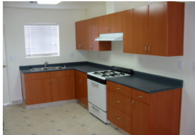
Top: the new homes line up beautifully on California Street. Above: this picture shows only half the available counter space in a typical kitchen. Plenty of space to allow cooking for large families. Lots of cupboards too.